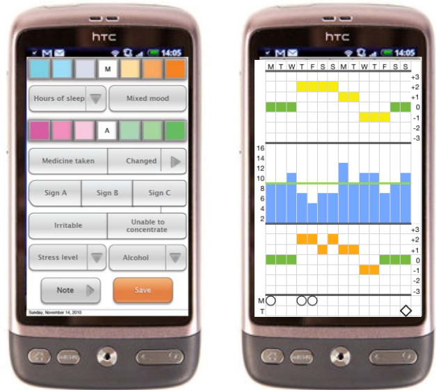
Figure 2. The MONARCA application on an Android phone. Left: The self-assessment form. Right: A graph showing data collected over two weeks on mood, sleep, activity, and medication.

We think that this is an important insight into the design of persuasive technologies for mental illness and self-management. Many of the technologies and metaphors reported so far deal with personal life-style related health management, which is fundamentally different from patients with a mental illness. Thus, we used a variant of the metaphor strategy to provide feedback to the patient that would be more sensitive to their illness – a trigger and coaching system, which is described in the next section as one of the goals of our system design.