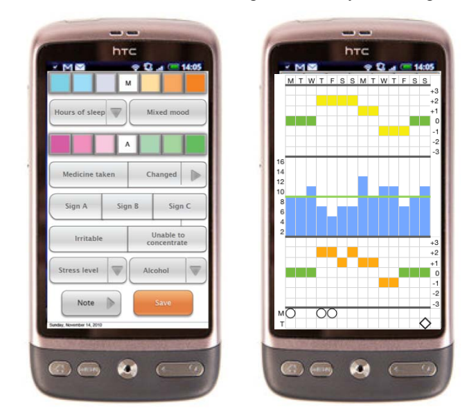
Figure 2. The MONARCA application on an Android phone. Left: The self-assessment form. Right: A graph showing data collected over two weeks on mood, sleep, activity, and medication.

We think that this is an important insight into the design of persuasive technologies for mental illness and selfmanagement. Many of the technologies and metaphors reported so far deal with personal life-style related health management, which is fundamentally different from patients with a mental illness. Thus, we used a variant of the metaphor strategy to provide feedback to the patient that would be more sensitive to their illness – a trigger and coaching system, which is described in the next section as one of the goals of our system design.