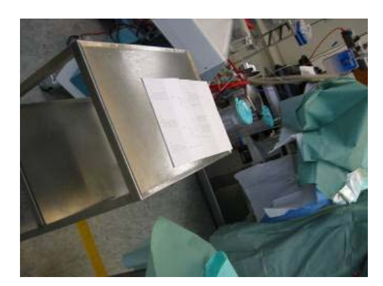
Fig. 1. Using a paper-based medical record while operating

Relatively few detailed field studies of operating theatres with a technical focus in mind have been made, but as pointed out by Heath et al. [8] an operating theatre is clearly an intense work setting, where life-critical work is being done in close, and often silent, cooperation between extremely skilled persons. One of the main findings from these observations was that in order to make this delicate collaborative work succeed, there was a constant access to clinical and other related information before, during and after the operation. Furthermore, important aspects of the operation were captured and this information was afterward shared collaboratively. Hence, it became interesting to understand what kind of information was accessed and captured, when, by whom, and for what purpose. Our findings are summarized in Table I and are further detailed below.