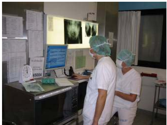
Fig. 2. Accessing medical images and an electronic medical record while operating

In the situations we observed there was a clear need for accessing information during the operation but in all the cases the access to the digital information was problematic and required that external books were brought in, that the nurse had to navigate and read aloud, or that the surgeon had to move away from the patient to access the information.