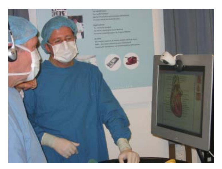
Fig. 6. Evaluation workshop

As a preliminary evaluation of ActiveTheatre, we conducted a scenario-based evaluation workshop in order to assess whether the system supported the need for collaborative, event-based access and capture in an operating theatre. The participants in the evaluation workshop were two surgeons, an anesthesiologist, and two operating nurses. The workshop lasted six hours and took place in a simulated operating theatre at our university. This operating theatre contained an operating table with a 17 inch touch screen on a moveable arm, a large wall-based display in the background, and microphones and loudspeakers. A picture from the workshop is shown in Figure 6. The workshop was divided into a five-hour 'play' part and a one-hour interview part; in the play phase, the clinicians played the scenarios a number of times and in the interview phase a focus group interview was done. We video recorded the whole workshop and have subsequently analyzed the tapes.